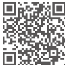
Sustainability / LEED